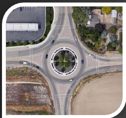
Amity/Happy Valley Nampa