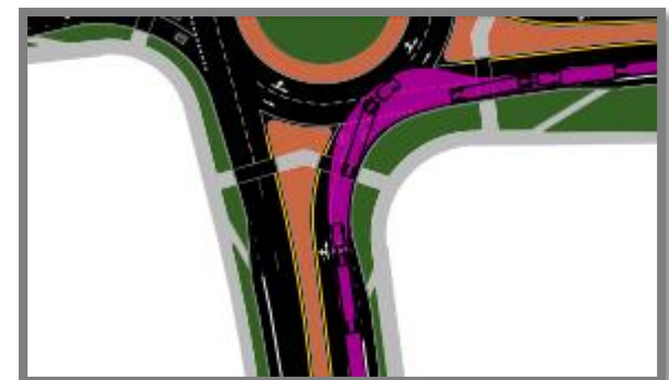
Making a right turn