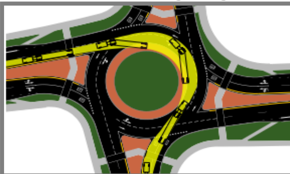
Making a left turn

Maneuvering single- and multi-lane roundabouts in large trucks and oversize vehicles